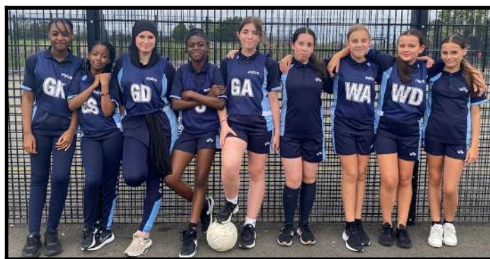
Year 8 Girls Netball