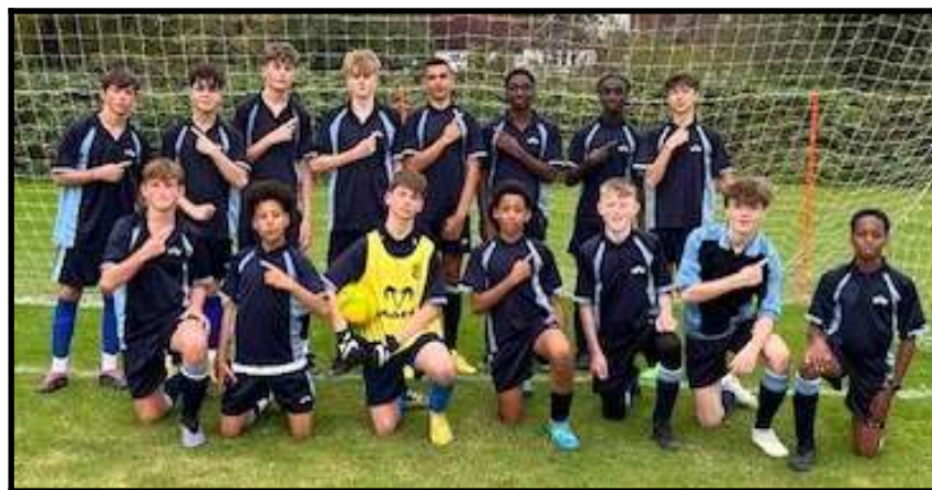
Year 9 Boys Football Team