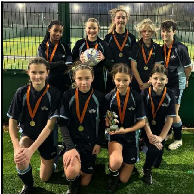
Y8 Girls Football Team