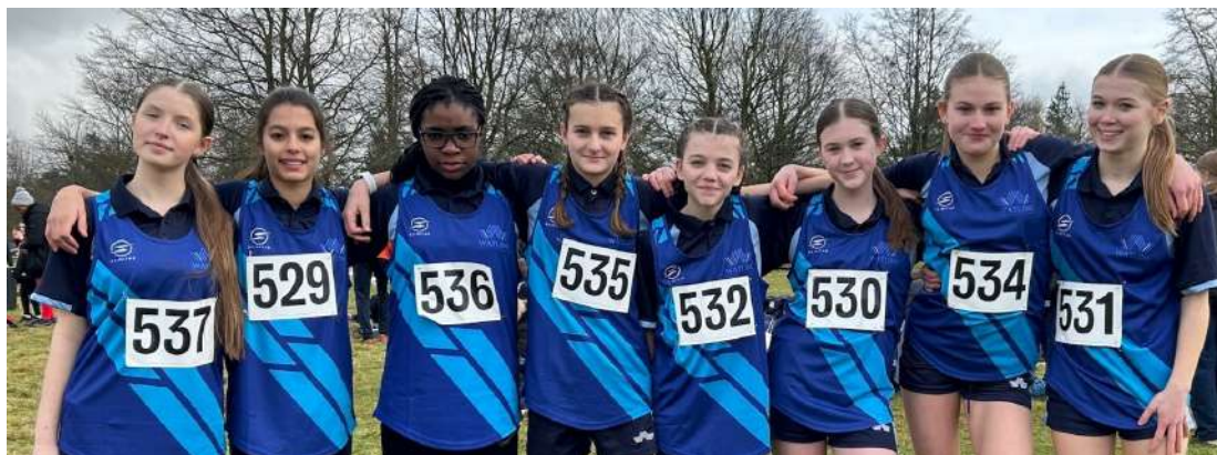
Junior Girls Team