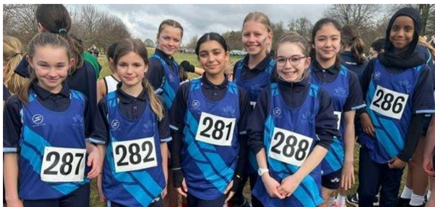
Y7 Girls Team