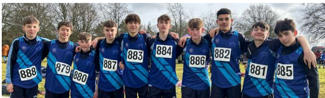
Junior Boys Team