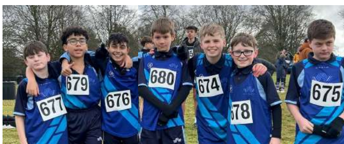
Y7 Boys Team