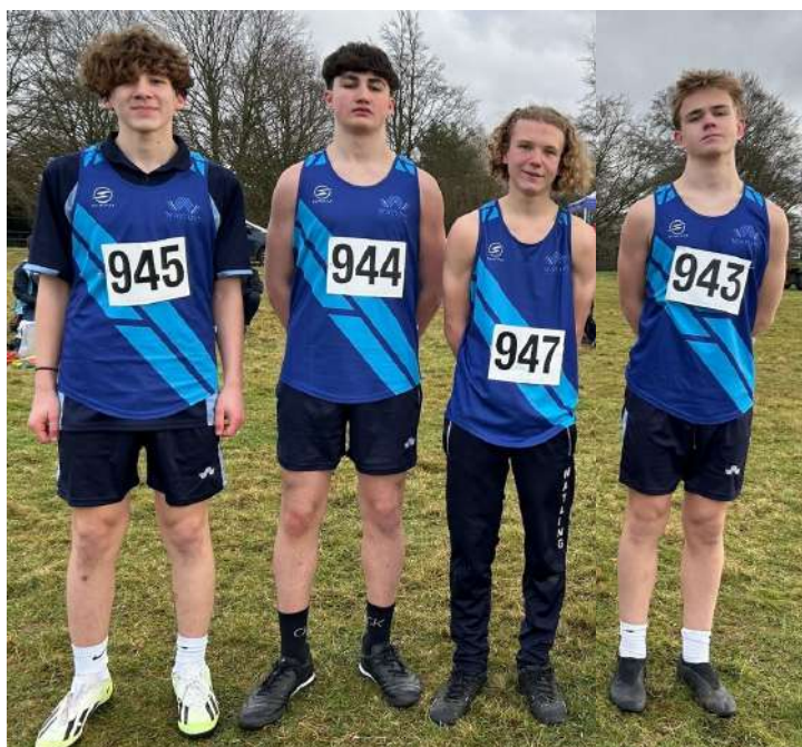
Inter Boys Team