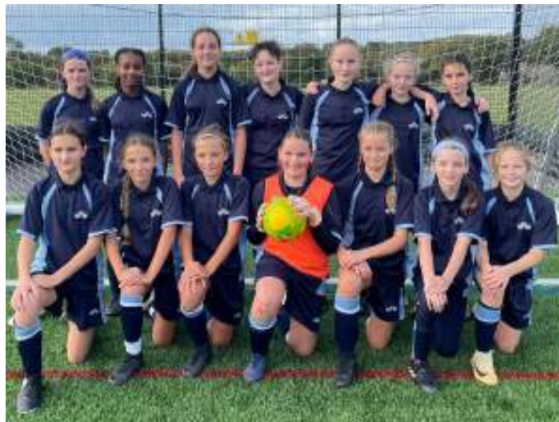
U13 Girls County Cup Football Team