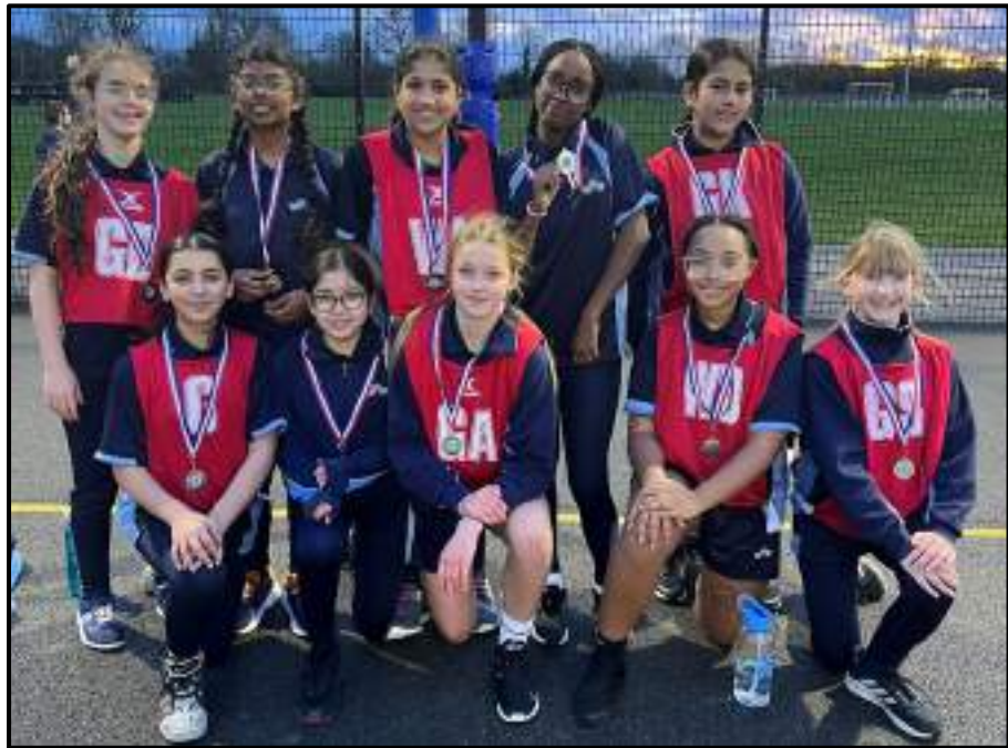
Year 7 Girls Netball Team