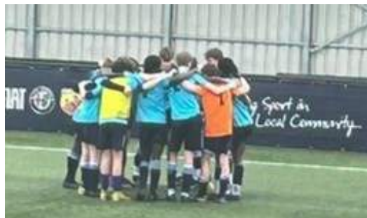
Y9 Boys Football Team— County Cup Final