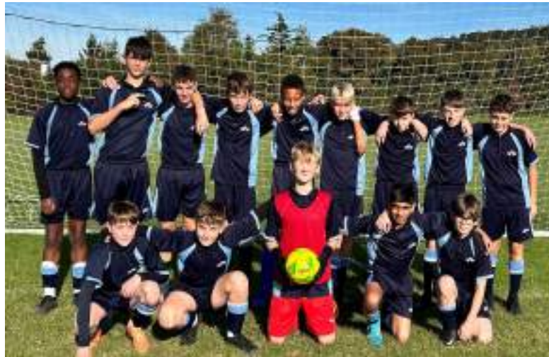
Year 8 Boys County Cup Football Team