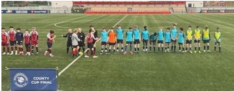
Y9 Boys Football Team— County Cup Final