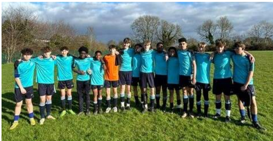
Y9 Boys Football Team—Semi Final