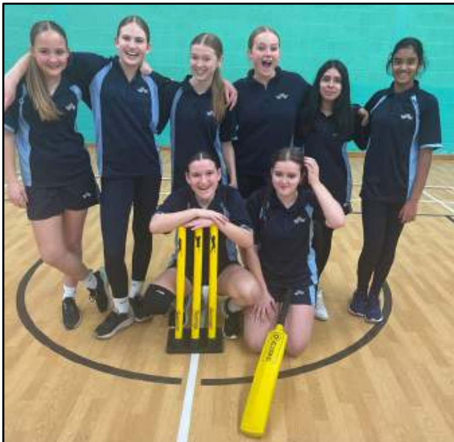
Year 9 Girls Cricket Team